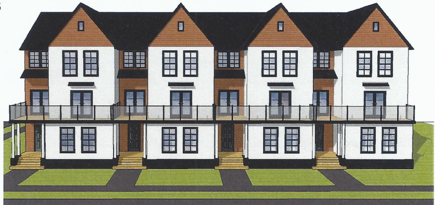
NOTE: Images are for illustrative purposes only. Please speak with a member of Development Services for information on your specific property.